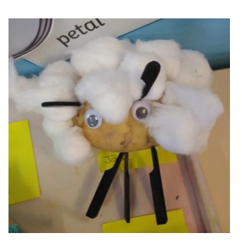
Jack - Walnut (Foundation Stage)

The day was a huge success and brought smiles to all of our faces.