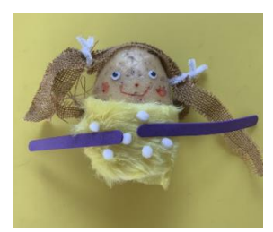
Texas - Maple (KS1)